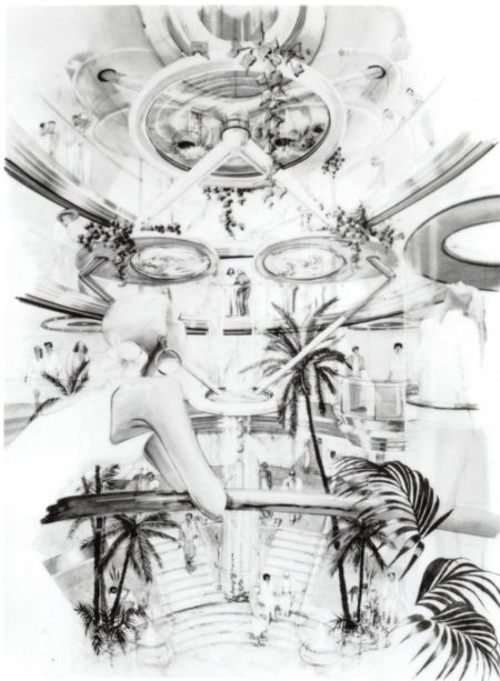
NORDIC EMPRESS' stunning nine-deck "Centrum" will feature a multi-level fountain which falls in a controlled cascade from one level to another. The 1,610-passenger Royal Caribbean Cruise Line ship, will begin sailing from Miami to the Bahamas in May 1990.