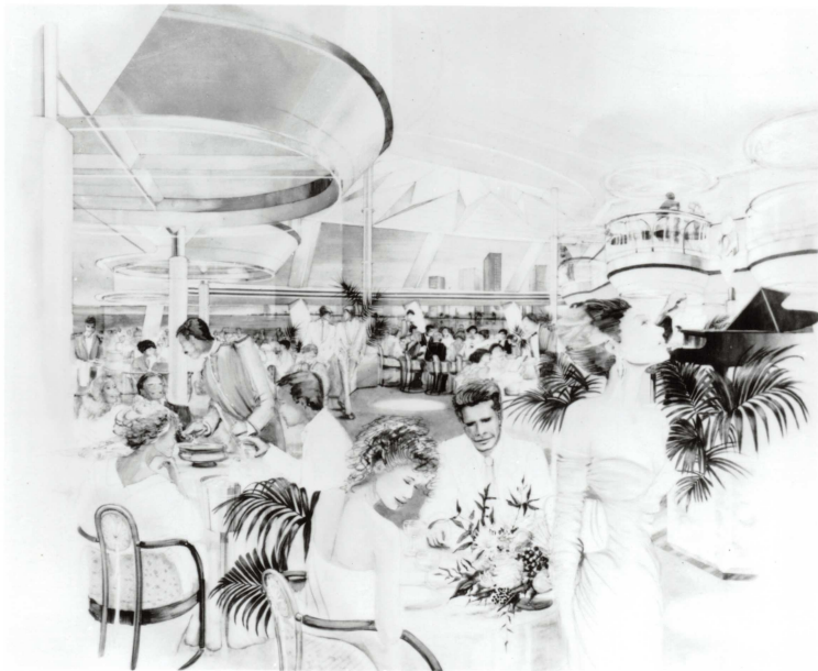
The elegant two-tier dining room aboard Royal Caribbean Cruise Line's NORDIC EMPRESS has winding staircases and a wall of windows spanning two decks for a 180 degree view. The 1,610-passenger cruise ship will begin three- and four-night cruises from Miami to the Bahamas on May 14, 1990.